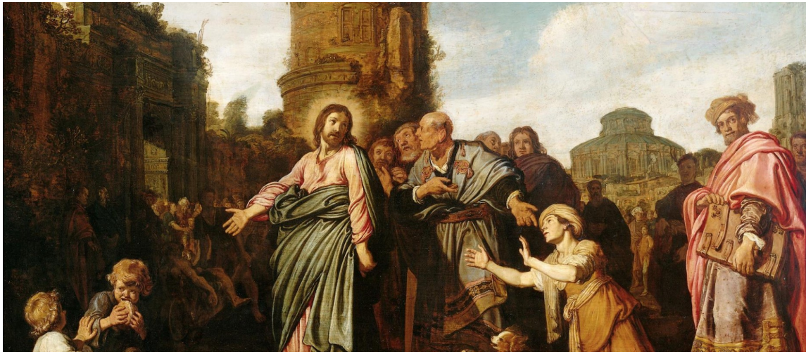
Christ and the Woman of Canaan by Pieter Lastman, 1617