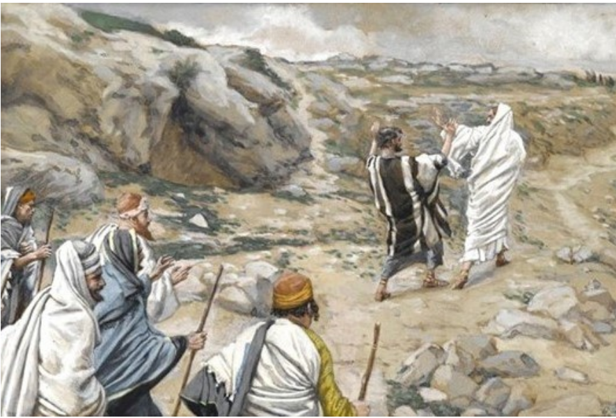
Get Thee Behind Me, Satan (Rétire-toi, Satan) by James Tissot, c. 1886–1896