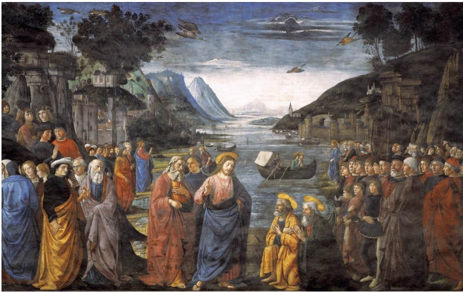
Vocation of the Apostles by Domenico Ghirlandaio, 1481-82